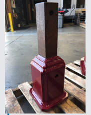
130MM SQ. BOX X 3-1/2" SQ. MALE (Quantity 1)