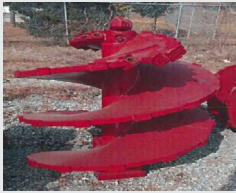
46" MAX CUT ROCK AUGER (Quantity 1)