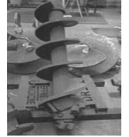
16" MAX CUT ROCK CUTTER HEAD (Quantity 1)