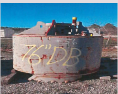
76" DRILLING BUCKET (Quantity 1)

TAKE AN ADDITIONAL 5% OFF when "Check By Phone" is selected as your payment option.