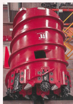
37.50" MAX CUT ROLLER CONE CORE BARREL (Quantity 1)