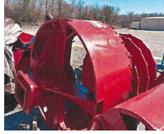
66" MAX CUT CORE BARREL (Quantity 1)