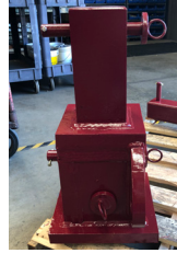
6" BOX FEMALE X 5 1/4" MALE ADAPTER (Quantity 1)