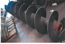
24" CFA FLIGHT BODY (Quantity 1)