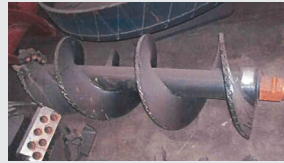
24" MAX CUT DRAGON ROCK CUTTER HEAD (Quantity 1)