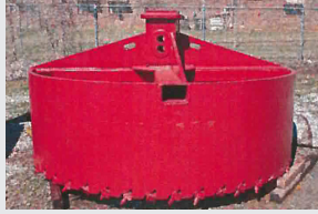
102" MAX CUT CORE BARREL (Quantity 1)